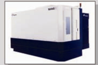
MAG3 Machine Tool Simulation