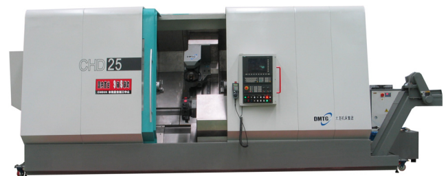
DMTG CHD 25 9-Axis Mill/Turn