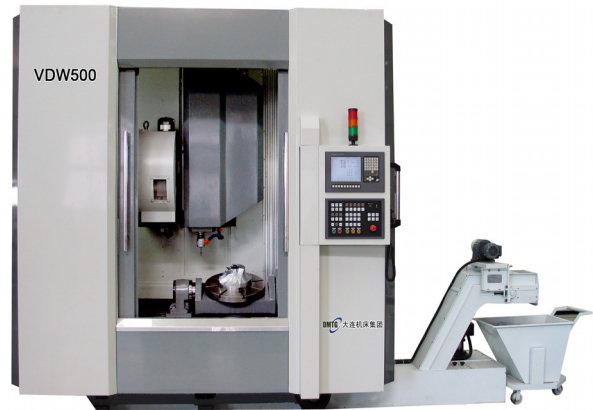
VDW500 Vertical 5 Axis Machine Center

“The Chinese machine tool market is growing rapidly and we plan to diversify our product line to include state-of-the-art 5-axes machines primarily targeted to the aerospace and automotive industries,” said Baoqing Zhou, Chief Engineer at Dalian. “ICAM has been the leading supplier of advanced NC manufacturing software products worldwide for over 35 years and we are confident that our customers will now benefit from an integrated NC post-processing and machine tool simulation solutions allowing them to capitalize on Dalian machine tool investments.”