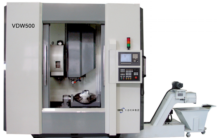
Virtual DMTG VHT500 Machine Tool