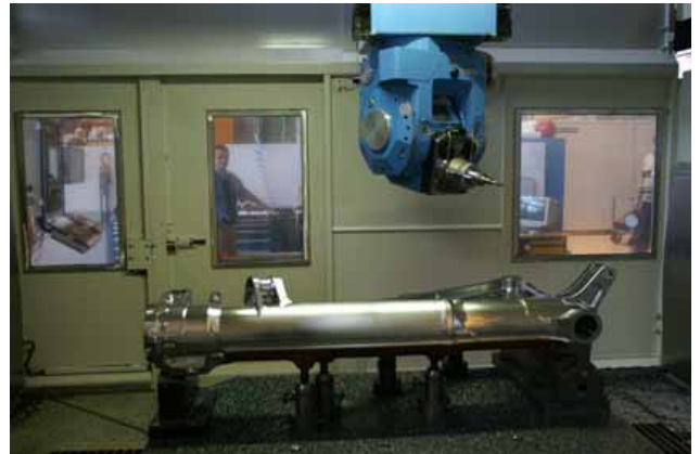
Droop + Rein FOGS D40